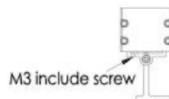
M3 include screw

1、Drill two holes in the wall or floor according to the hole size of the support, and put glue plugs or wood blocks into the holes.